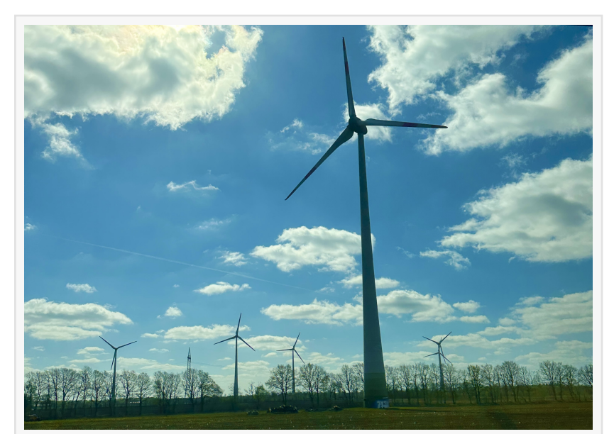
Wind turbines generate power converted into electricity, which is then stored in saltwater flow batteries. These batteries efficiently store and release energy, providing a reliable renewable energy solution that's both eco-friendly and sustainable.

This press release can be viewed online at: https://www.einpresswire.com/article/652910981