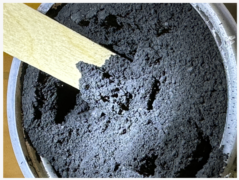
Simultaneously producing graphene from flow battery energy storage