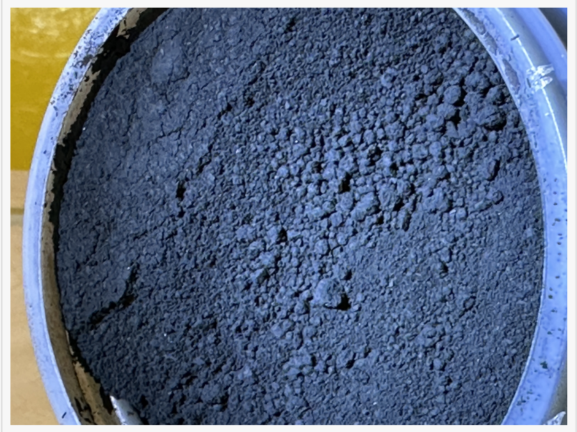
Salgenx simultaneous production of graphene

Salgenx has recently published the "Salgenx Saltwater Redox Flow Battery Technology Review," a comprehensive report detailing the advancements and capabilities of their innovative energy storage technology along with simultaneous production of graphene, cathode materials, and carbon nanoonions (CNO). The report provides an in-depth analysis of flow battery technology including ultracapacitors and their possible applications in a saltwater battery system. It highlights