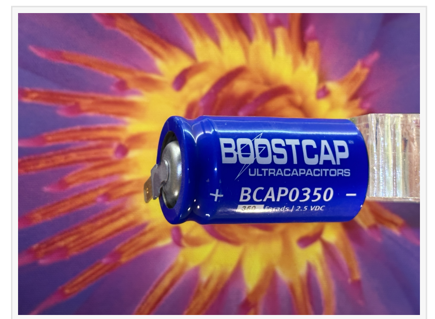
Example of Ultra Capacitor

With this groundbreaking advancement, Salgenx aims to accelerate the adoption of flow battery technology in various sectors, including renewable energy integration, gridbased energy storage, and industrial applications. The implications of this