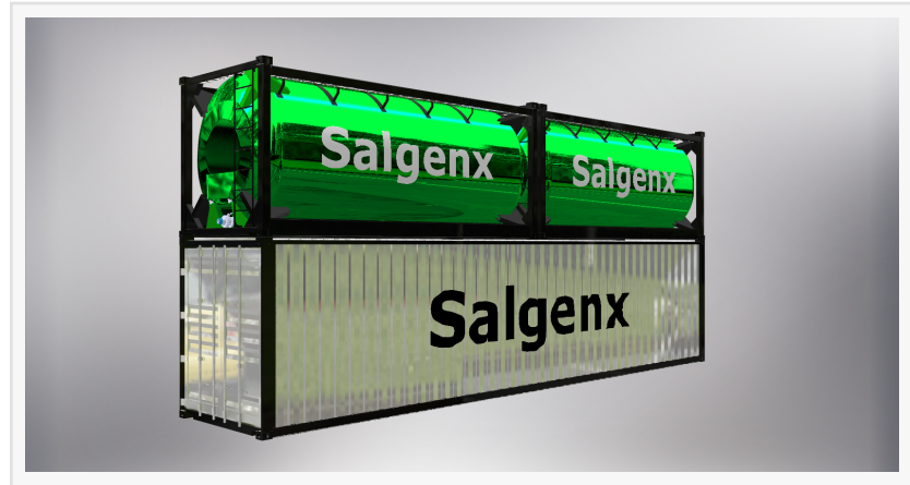
Salgenx S3000 Salt Water Battery Energy System

By utilizing Ultracapacitors as the electrode material or externally as a bridge between the battery and grid, Salgenx's Saltwater Redox Flow Batteries can deliver exceptional power performance, making them ideal for demanding applications such as grid stabilization, peak shaving, and renewable energy integration. The Ultracapacitors act as a power buffer, enabling the flow battery to handle sudden load spikes and deliver power instantaneously. This rapid power response from the Ultracapacitors complements the slower response time of the redox flow battery,