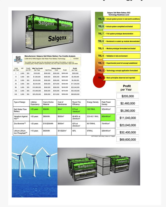
Salgenx Flow Battery Tech Report

providing a balanced and efficient energy storage solution.