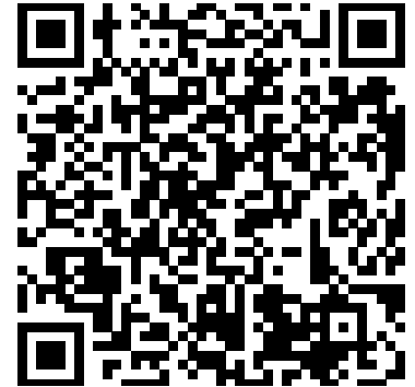
This webpage QR code